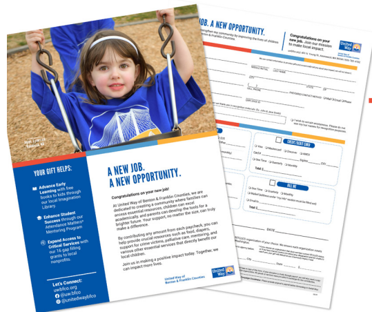
New Hire Pledge Form