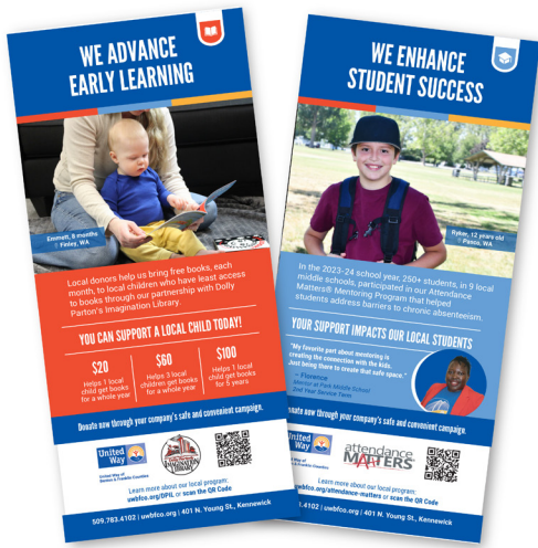
Program Rack Card